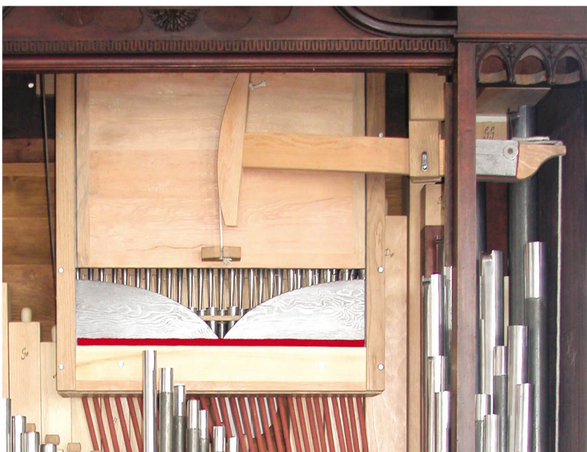
The Goetze & Gwynn "nag's head" swell box