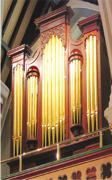
The pipes at St George's RC Church, York